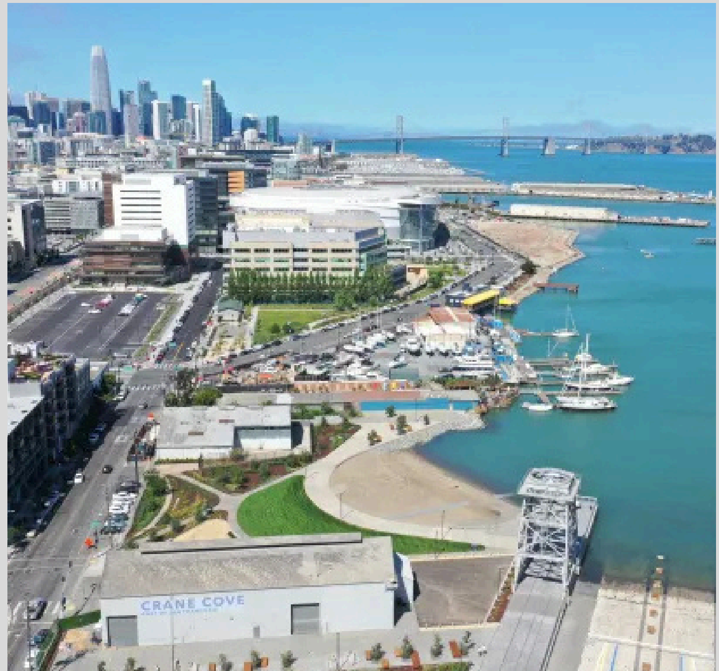
Image of Crane Cove Park

A seven-acre waterfront park featuring beach access for kayaking and paddleboarding (swimming prohibited). The park includes spacious lawn areas with picnic tables, benches, and grills, perfect for gatherings. Families will enjoy two children's play areas, while four-legged friends can take walks in the dedicated dog run.