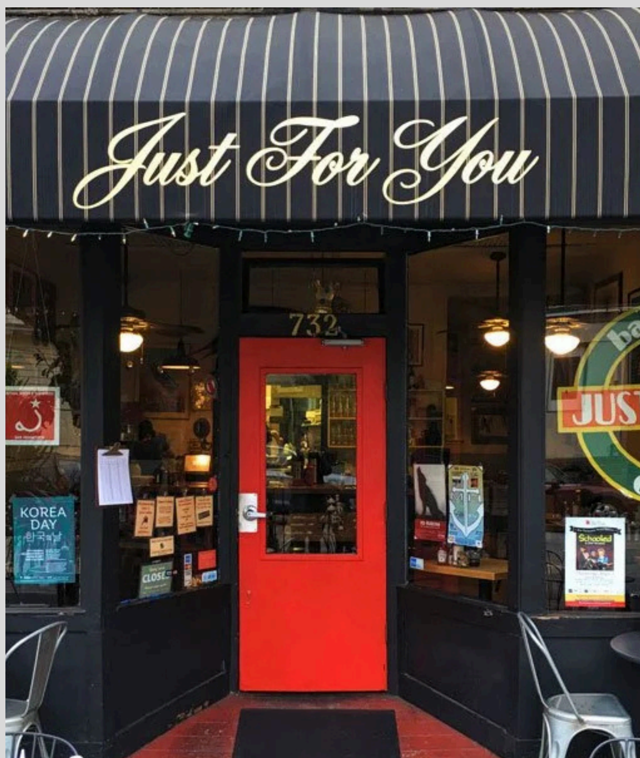
Image of Guiliana's Just For You Cafe

Inspired by Asian and American culinary traditions, Breadbelly offers an array of seasonal pastries crafted from ingredients sourced through local market and farmer partnerships.