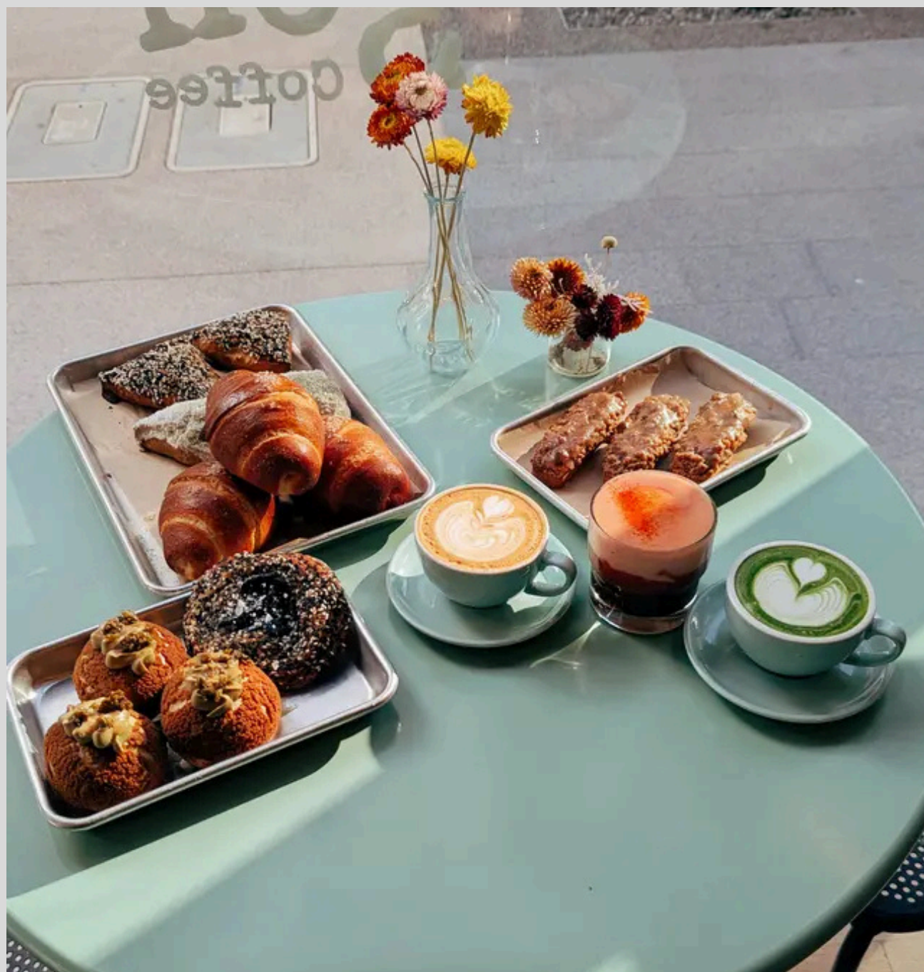
Image of Paper Son Coffee