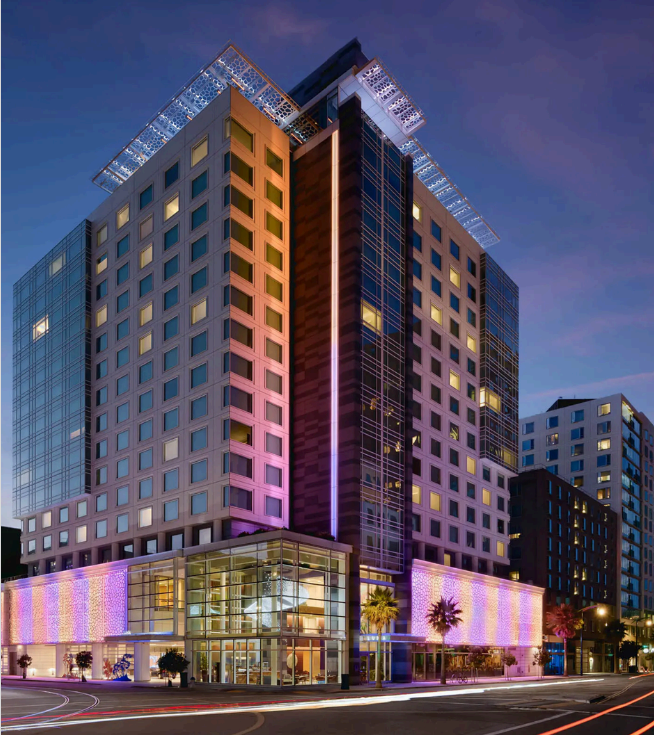
Image of Luma Hotel