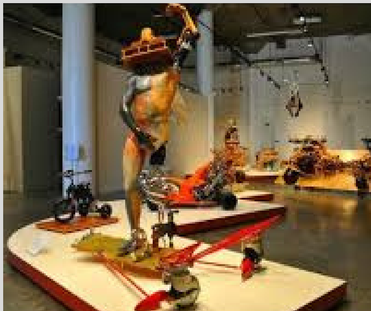
Image of Exhibition at Museum of Craft and Design

San Francisco's only museum dedicated to craft and design. Open Thursday–Sunday, 12:00–5:00 PM. General admission is $10, available at the door or online up to 60 days in advance. A must-visit for anyone interested in contemporary craft, design, and artisan work.