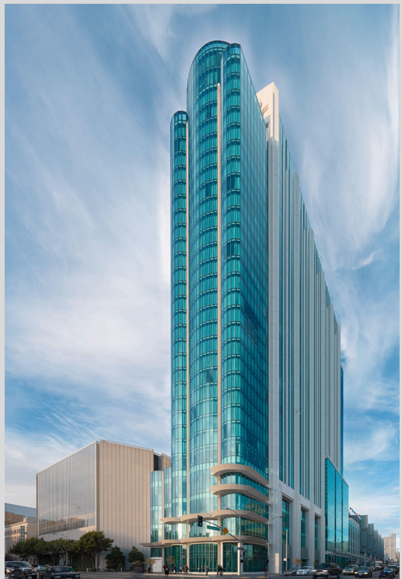
Image of Intercontinental

Premium hotel next to Moscone Convention Center, within a short stroll of the financial district, entertainment venues, and downtown shopping. Pet-friendly with an on-site restaurant, pool, and fitness center. Ideal for business travelers and tourists.